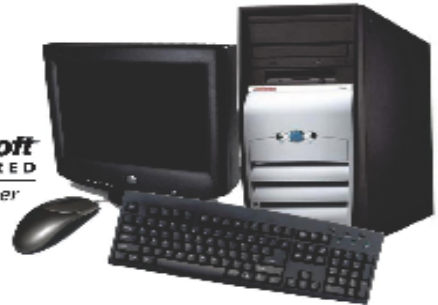
* May not be exactly as shown